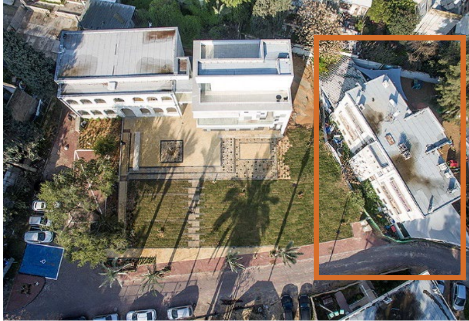
The building to be demolished and replaced by the Social Tech Zone