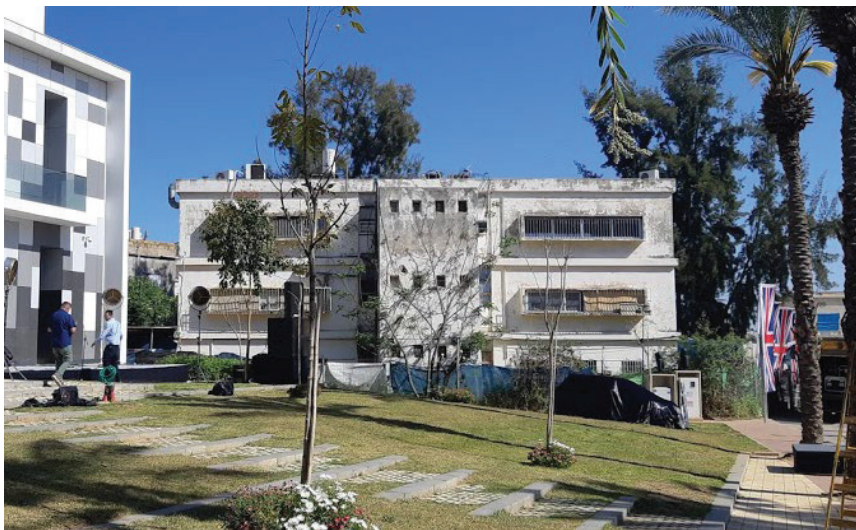
The site of the Social Tech Zone (right) adjacent to the Tech Hub and Campus

Appleseeds Academy is an Israeli non-profit founded in 2000 with the aim of connecting Israel's growing Startup Nation with underserved communities in the country's social and geographic periphery. Appleseeds was established to reduce socioeconomic gaps in Israeli society by providing disadvantaged populations with the technological tools and vocational training needed to increase their socioeconomic opportunities. With a training staff of 250 instructors and over 20 years of experience, Appleseeds currently reaches 100,000 beneficiaries in over 350 training locations throughout Israel. Appleseeds Academy's vision for Israel is technological equality for all; the organization promotes digital equality by developing and implementing programs in the areas of technology, employment, and life skills.