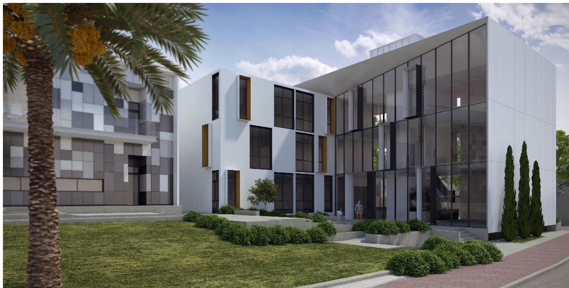
Illustration of the Social Tech Zone

Ramle, a city of about 75,000 residents in the centre of the country, has for many years been plagued by neglect, financial problems and a negative public image. Appleseeds first entered the city 15 years ago with up-to-date technological training for youth and adults, which has improved the lives of thousands of the city's residents. Appleseeds' impact in the city, bringing on board partners such as Cisco, Microsoft and Bezeq, plus the support provided by the mayor, is helping to transform the entire Ramle city centre into an innovative ecosystem.