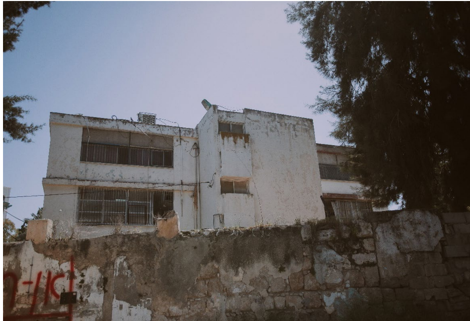
Another view of the existing building