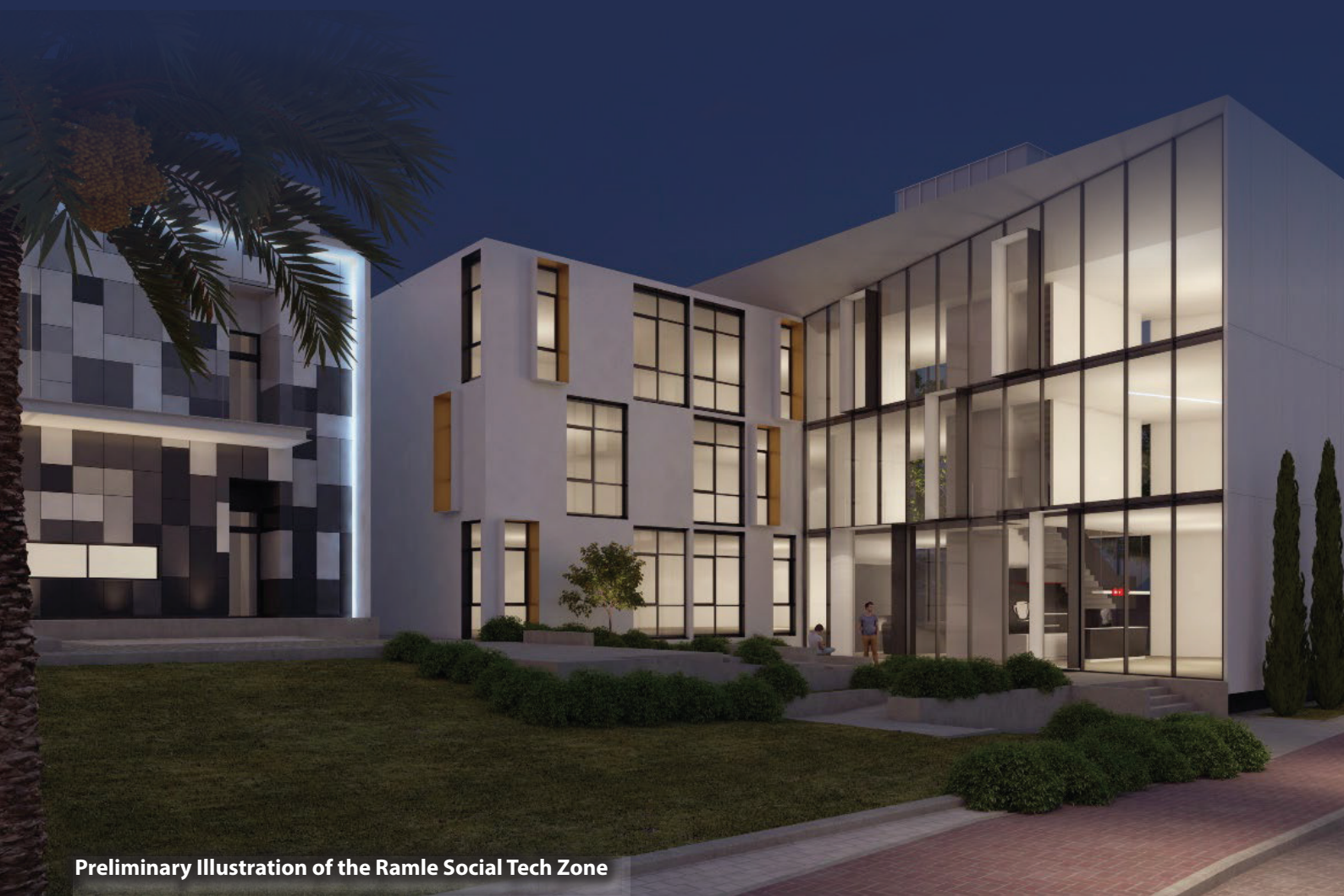
Preliminary Illustration of the Ramle Social Tech Zone

The Ramle Social Tech Zone: One Location, Infinite Possibilities